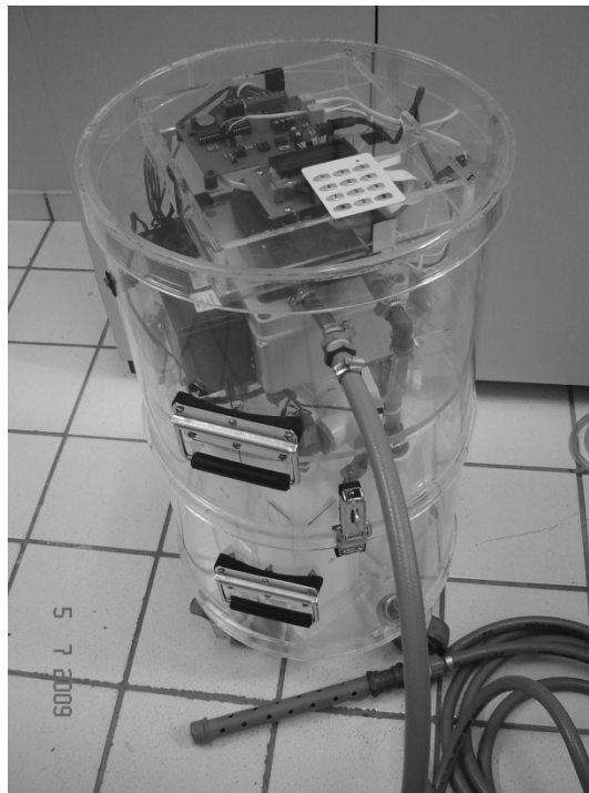
Figure 1. Front view of the automatic water sampler.

The basic equipment was conceived to provide an automatic water sample collection, previously defined by the user. For this purpose, a control system composed by two main components was developed: a) control system and data acquisition; b) sample collection and distribution system. Control system provides an interface with the user by using a keyboard and a LCD. Once sampling procedure is being made, an ultrasonic sensor provides the sampler water level data as a function of time.