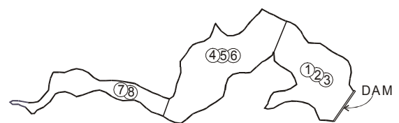
Figure 2. Barje reservoir segmentation

The Information System and the water quality mathematical model based on WASP 5 model (developed by EPA, Ambrose et al. [1993]) and supplemented by zooplankton dynamic, were used for the example of Barje reservoir. For the purpose of modeling, the reservoir was divided into 8 segments (3 epilimnion segments (1, 4, 7), and 5 hypolimnion segments), with advective and dispersive transport between them (Figure 2).